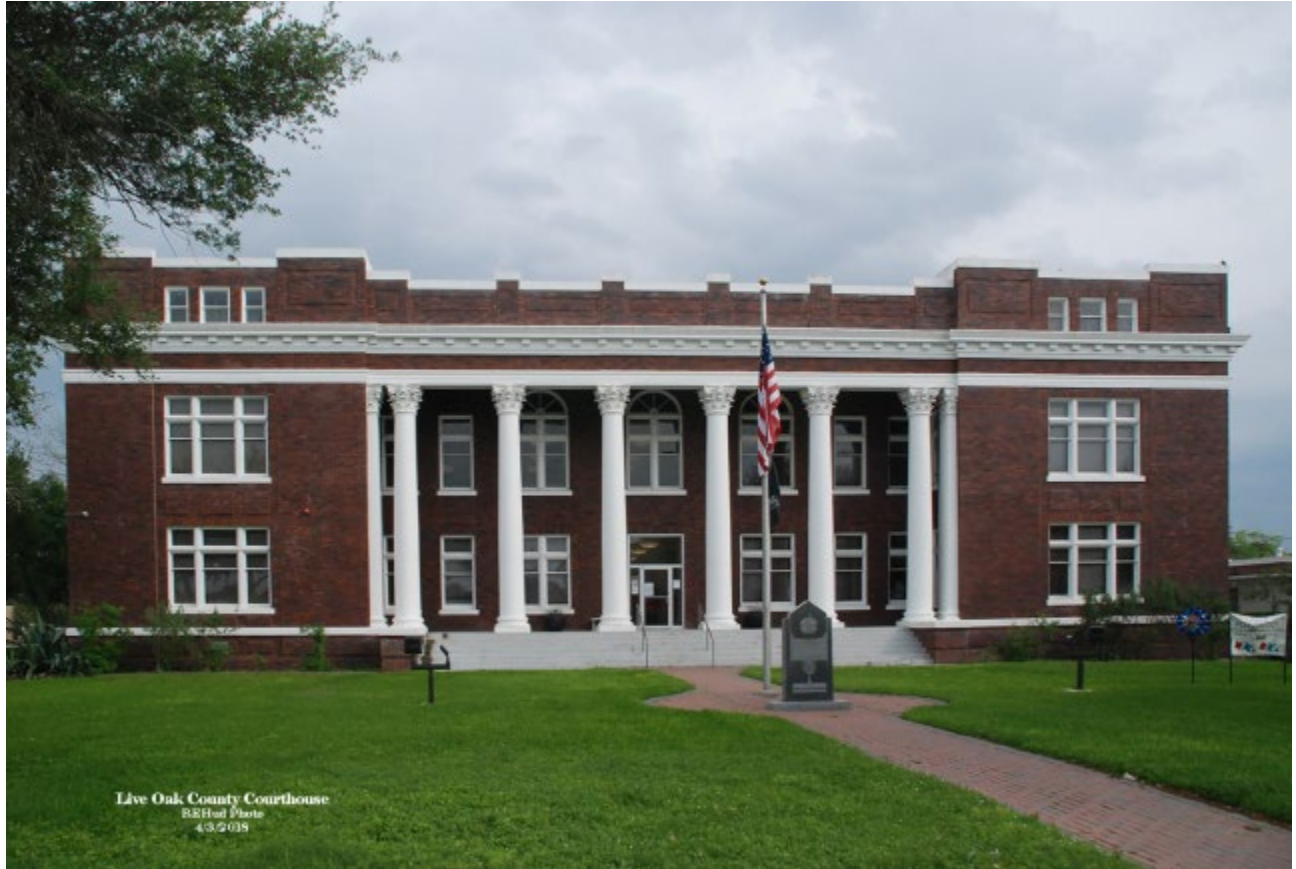
Live Oak County Courthouse B&H Photo 4/3/2019